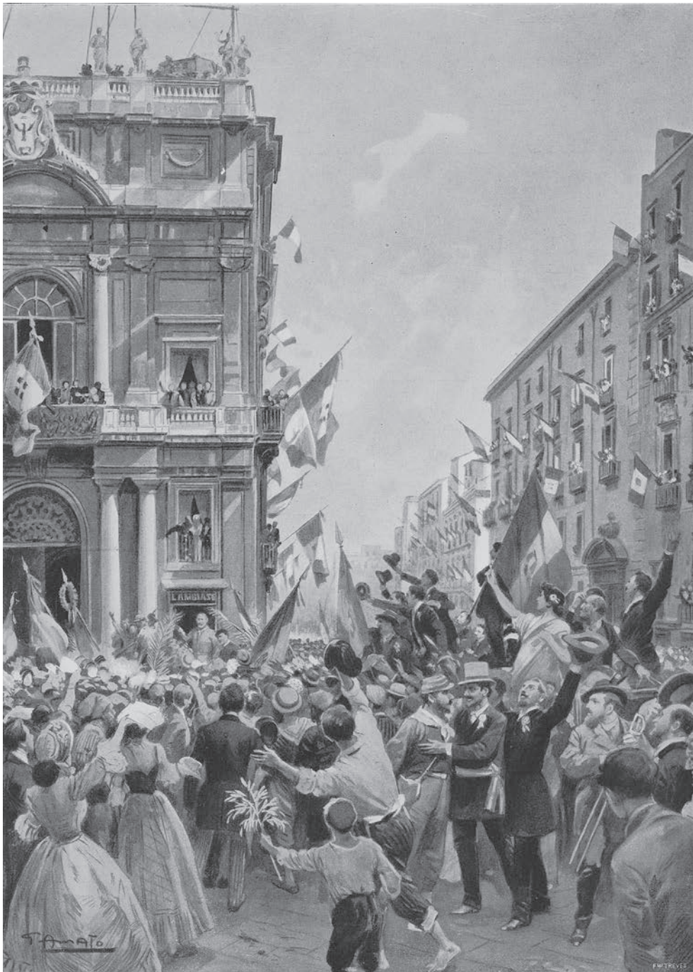
An Italian drawing from 1910 of Garibaldi announcing from a balcony in Naples the annexation of the Kingdom of the Two Sicilies to Italy in September 1860.